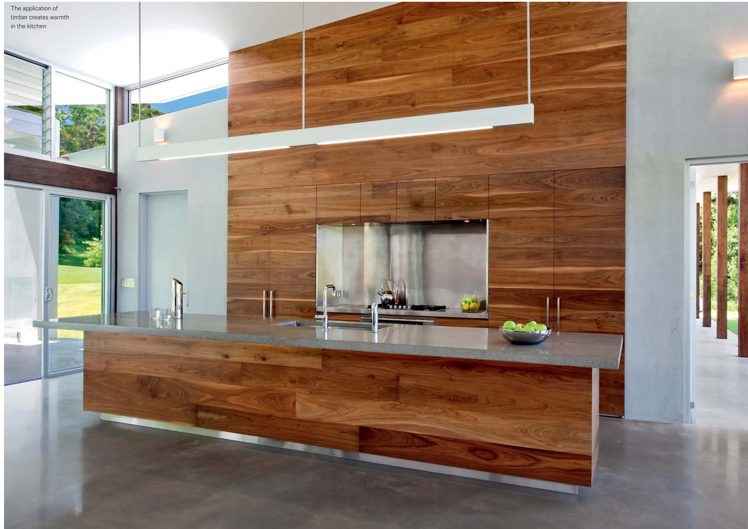
The application of timber creates warmth in the kitchen