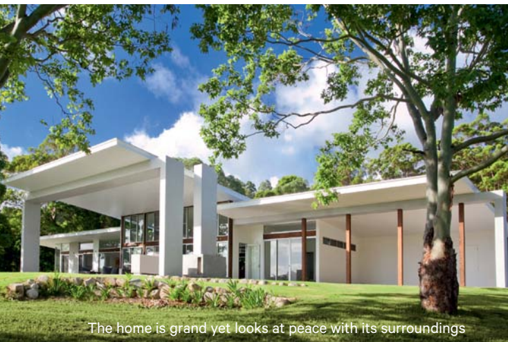
The home is grand yet looks at peace with its surroundings