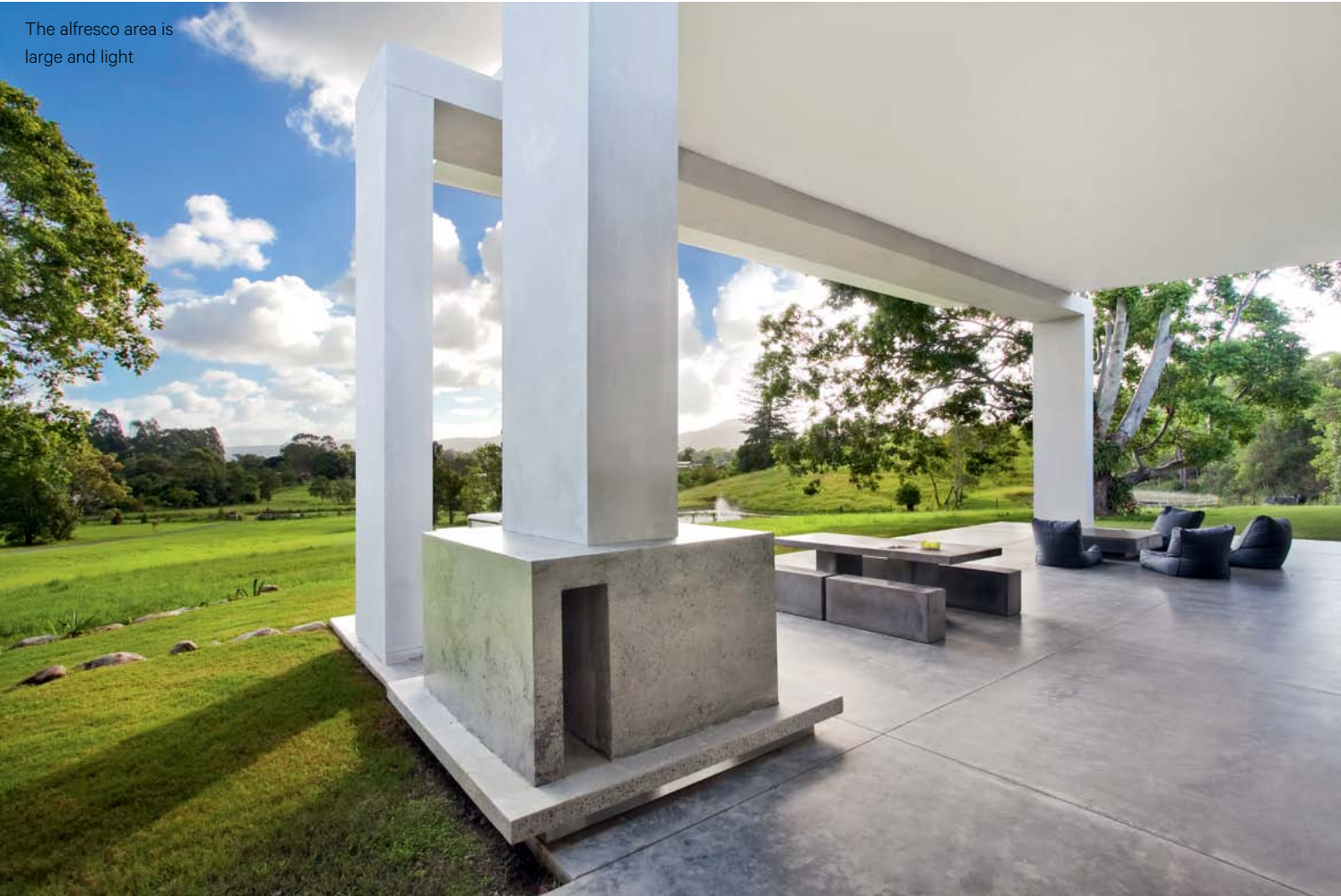
The alfresco area is large and light

tip, it permits light to reflect off the ceiling and naturally illuminate the space. To the opposite side of the alfresco area sits the large and inviting swimming pool. Contrasting with the greenery it is surrounded by, the pool is connected to the home by another outdoor area that is no doubt soon to be covered in wet footprints and inflatable pool toys. Even though this home is modern and open, it doesn't have the lifeless feel that can sometimes come with contemporary homes that get a little too carried away with the minimalist theme. Gerard's design is smart and innovative as it incorporates the location and light around the home and funnels it inside the dwelling. Even though the home makes a strong statement in its size and colour, it never encroaches on its surroundings or looks out of place. Every room has a view and every room is full of light; a complete contradiction to the old home. Following this mantra, Jared and Maree have nicknamed the home "Satori", which is in reference to the Zen Buddhist term of individual enlightenment. "To say we are happy with the final result would be an understatement," say Jared and Maree. "We are over the moon with the final result. It is such a beautiful home to live in; it still takes our breath away." 🏡