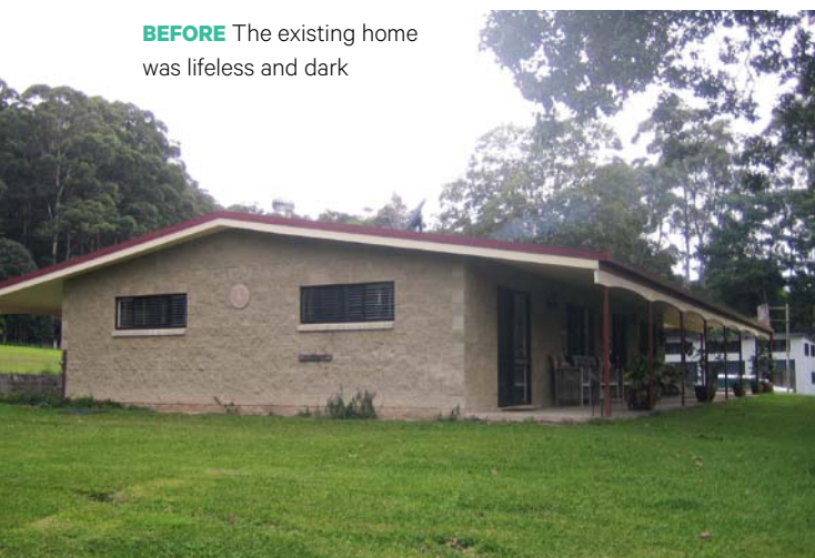
BEFORE The existing home was lifeless and dark

Australia's landscape is a wonder. Whether living in iconic surrounds of the Snowy Mountains in Victoria, the Kimberly in Western Australia or Uluru in the Northern Territory, most Australians love the colours and textures of their land and to have the tiniest view of it from your home is a privilege.